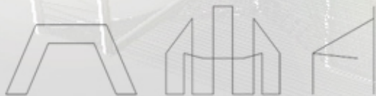
penelope armchair - to imagine colour